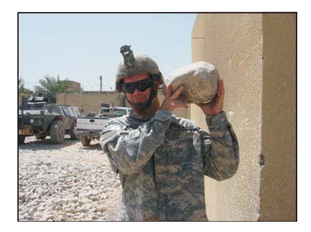
Figure 3-1. The consequences of a poorly-written PWS for a gravel parking area.